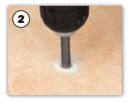
Once the hole has started, raise gradually the drill up to the vertical line.