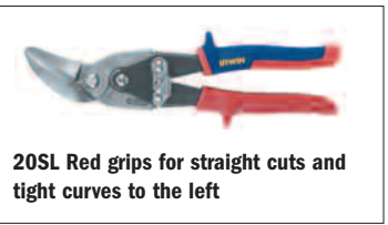
20SL Red grips for straight cuts and tight curves to the left